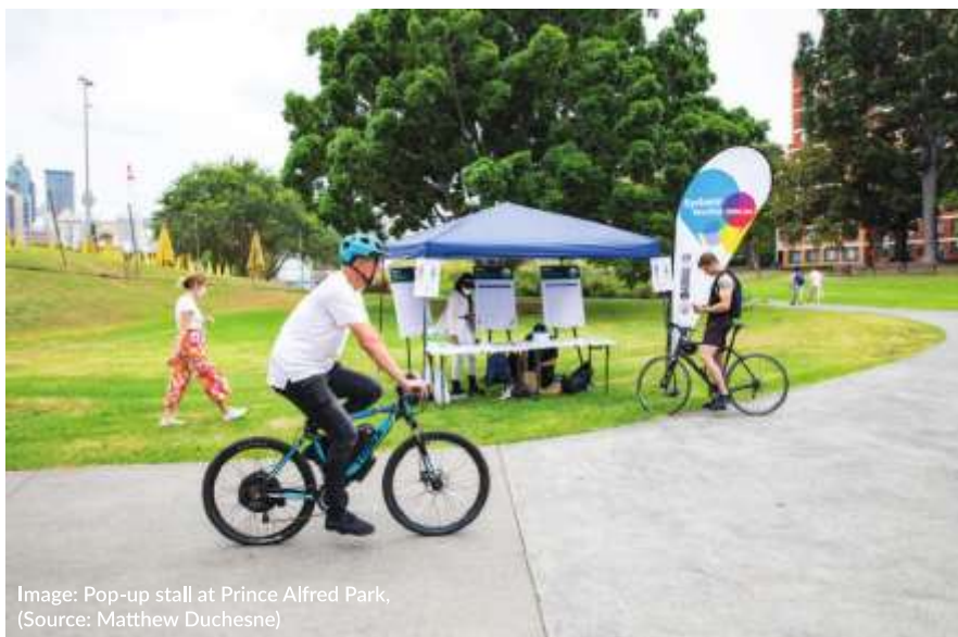
Image: Pop-up stall at Prince Alfred Park, (Source: Matthew Duchesne)