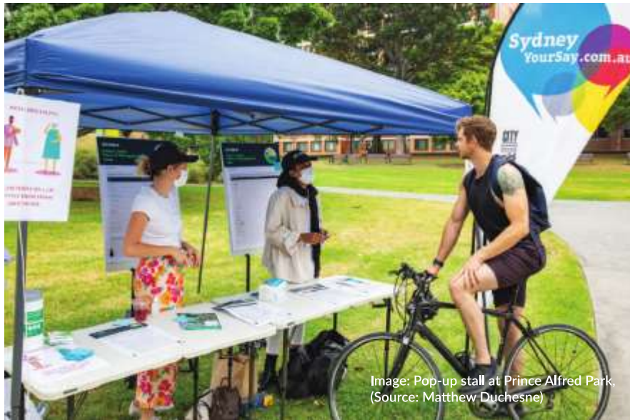
Image: Pop-up stall at Prince Alfred Park, (Source: Matthew Duchesne)