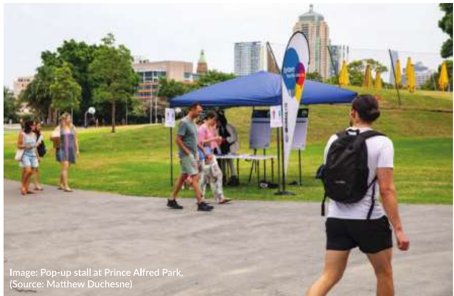
Image: Pop-up stall at Prince Alfred Park, (Source: Matthew Duchesne)