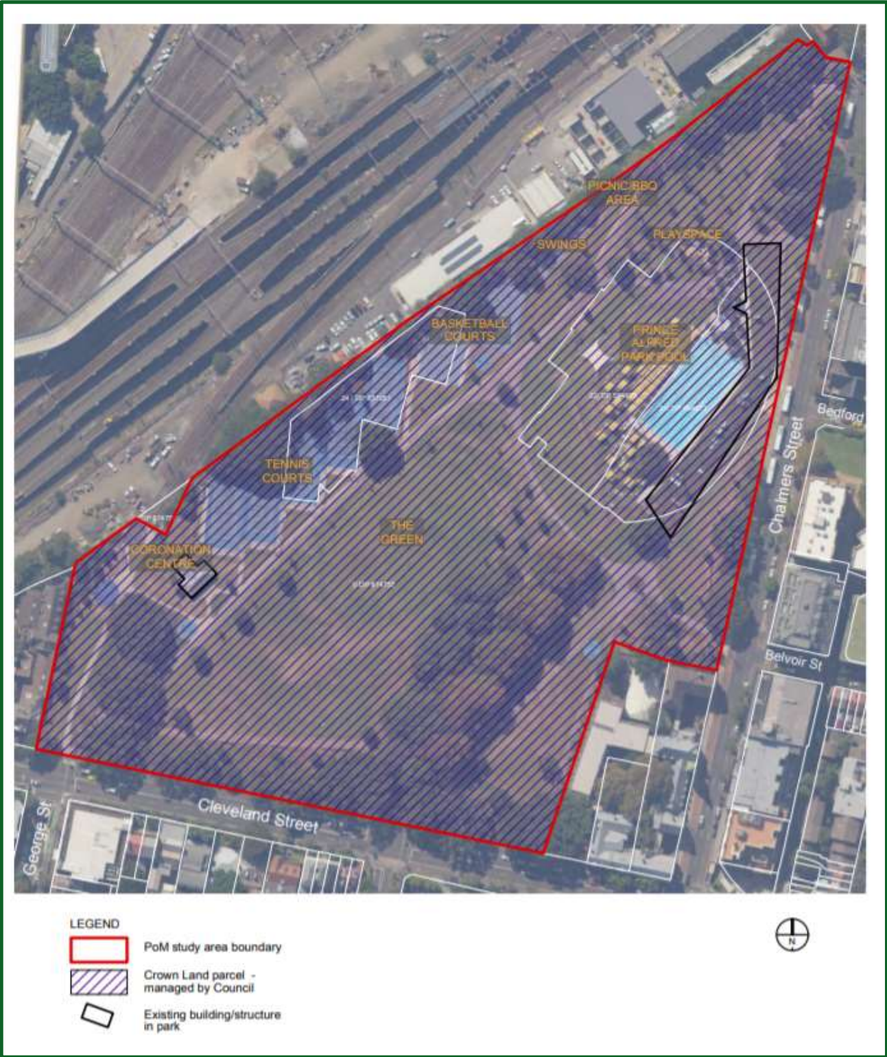
Figure 2. Site Plan