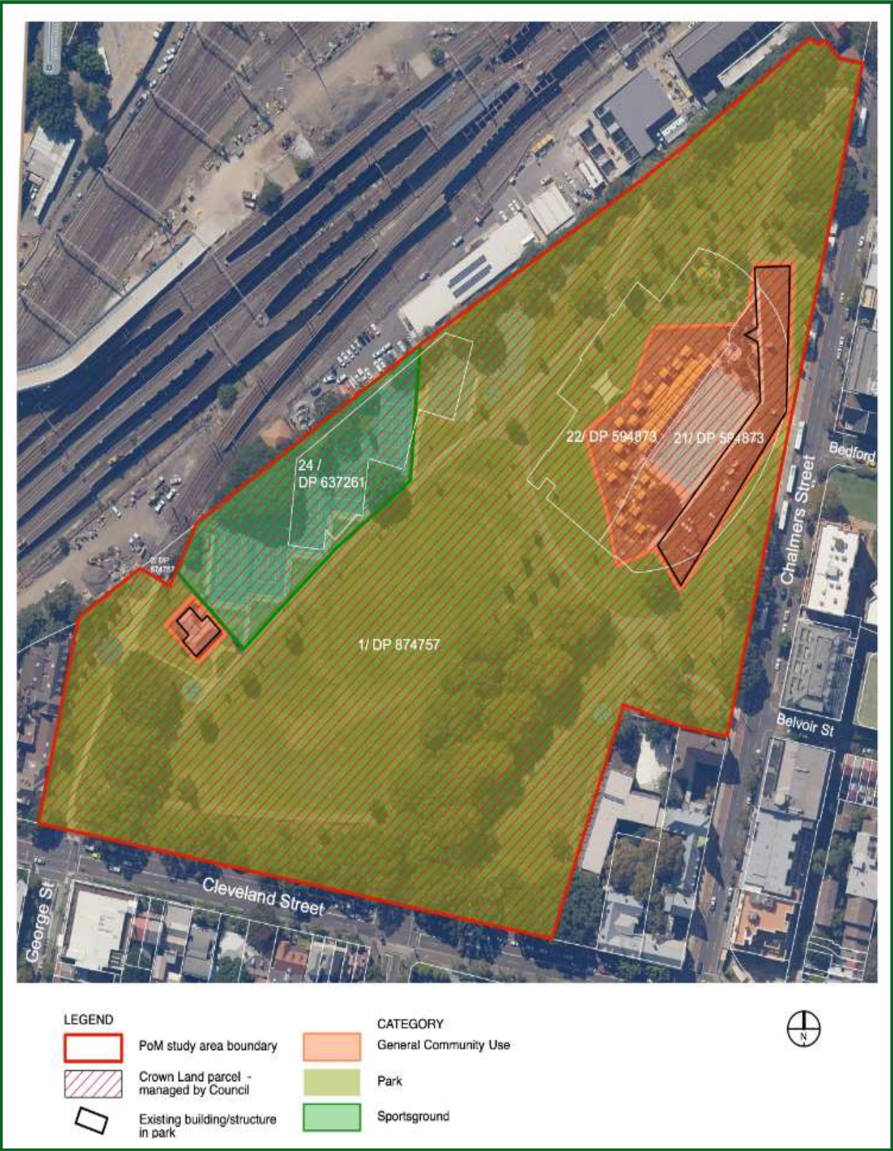
Figure 3. Community land categorisation map